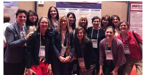
Student presenters at WIN with faculty mentors and Dean Emami.

2018 WIN Conference: ONR hosted Poster and Presentation Practice Sessions at the Western Institute of Nursing (WIN) research conference for four students. Eight student posters and podium presentations, nine faculty podium presentations and eight faculty posters represented the school at the conference.